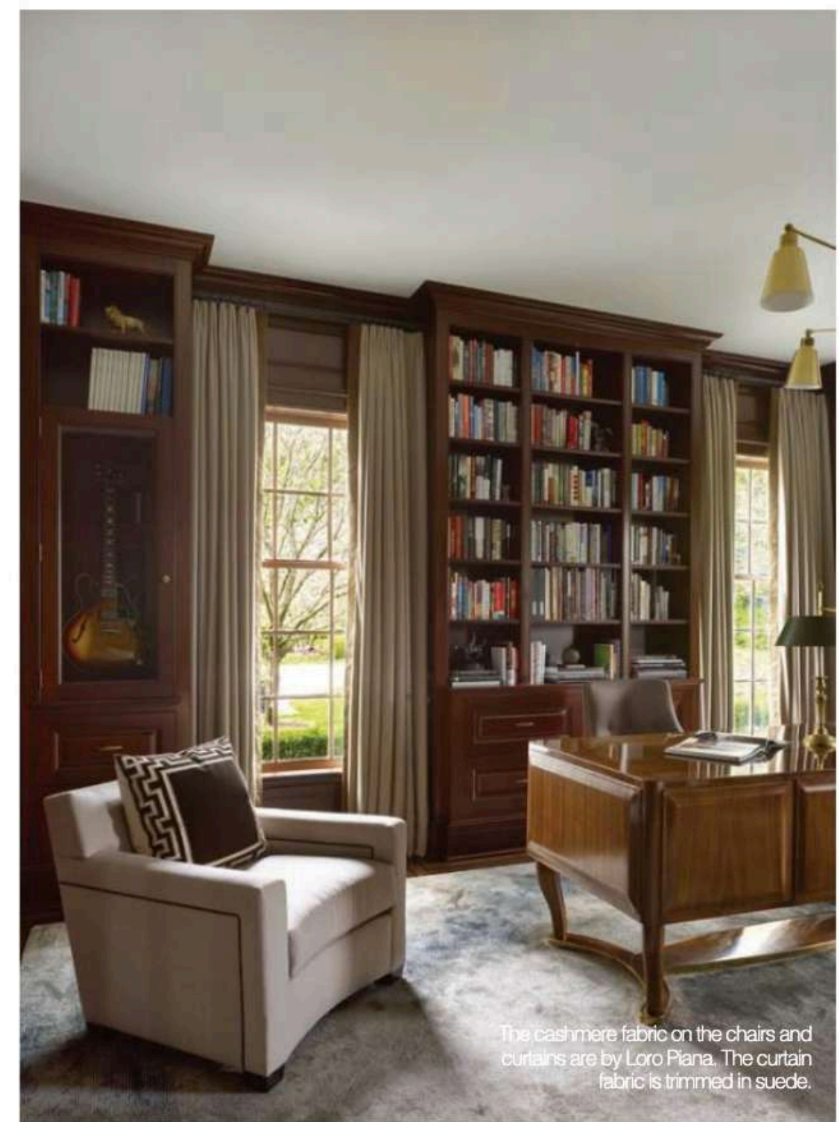
The cashmere fabric on the chairs and curtains are by Loro Piana. The curtain fabric is trimmed in suede.