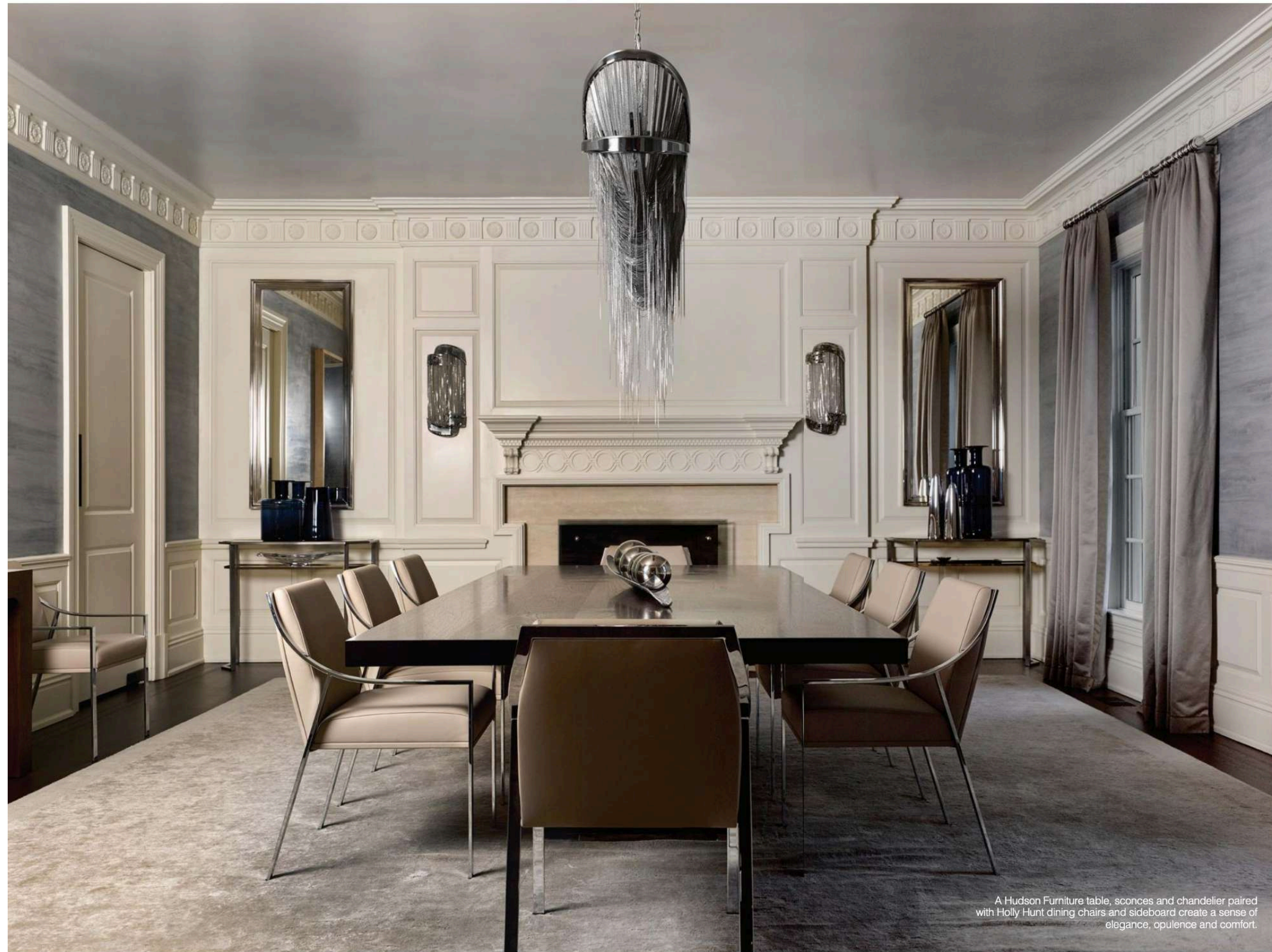
A Hudson Furniture table, sconces and chandelier paired with Holly Hunt dining chairs and sideboard create a sense of elegance, opulence and comfort.