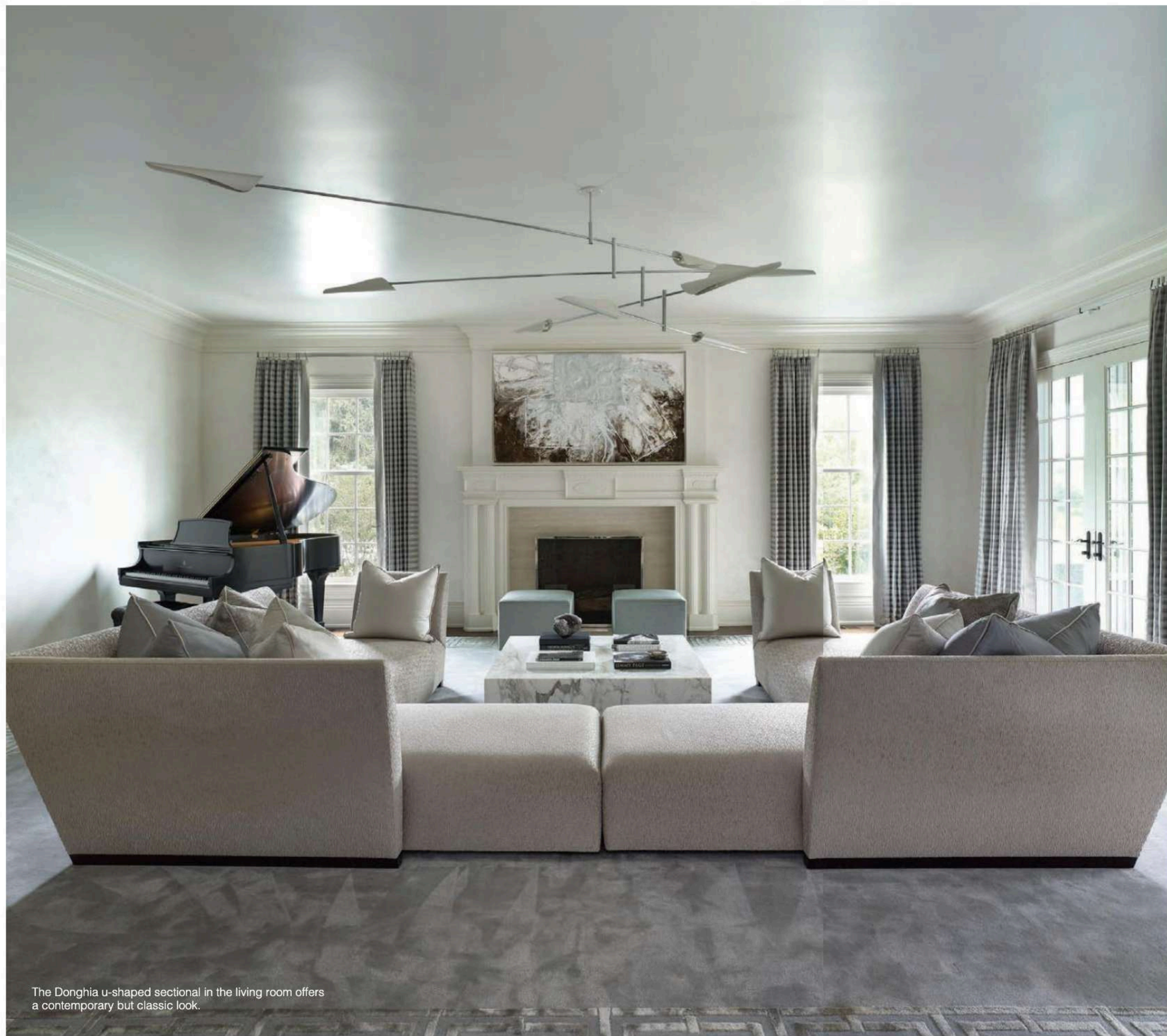
The Donghia u-shaped sectional in the living room offers a contemporary but classic look.